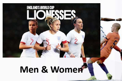
Men & Women