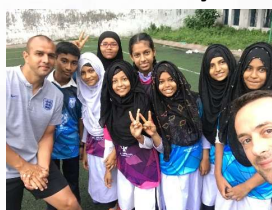
Girls & Boys